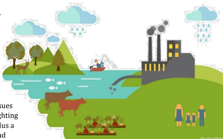
Figure E.2. Examples of radiation pathways

People can be exposed to radionuclides in the environment through a number of routes, as shown in Figure E.2. Potential routes for internal and external exposure are referred to as pathways. For example, radionuclides in air could be inhaled directly or could fall on grass in a pasture. If the grass were then consumed by cows, it would be possible for the radionuclides to impact the cow’s milk, then the people drinking the milk. Similarly, radionuclides in water could be ingested by fish, and fishermen or other consumers could then ingest the radionuclides in the fish tissue. People swimming in the water also would be exposed. Exposure to ionizing radiation varies significantly with geographic location, diet, drinking water source, and building construction.